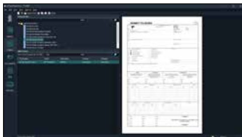
Electronic Forms (dark screen mode)