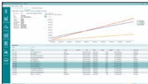
Comparing equipment running hours